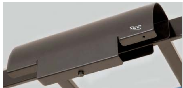
Attach to side rail

For more information, visit ICC's website at www.icc.com .