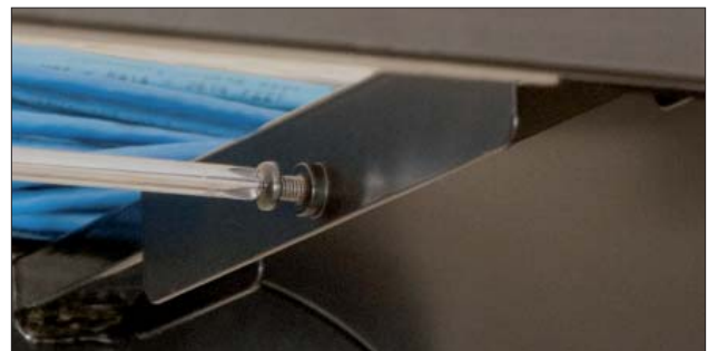
Tighten one screw